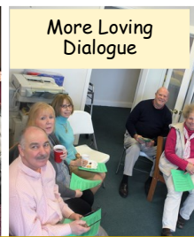
More Loving Dialogue