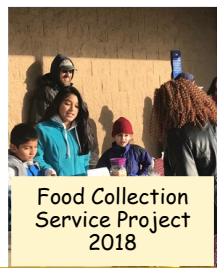
Food Collection Service Project 2018