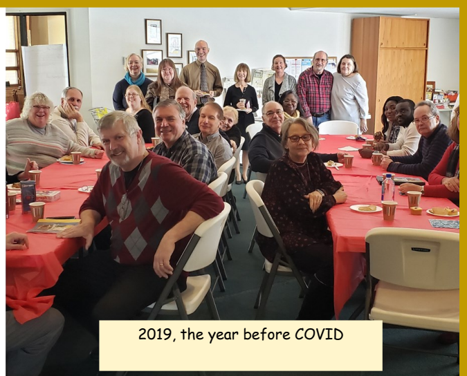
2019, the year before COVID