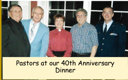
Pastors at our 40th Anniversary Dinner