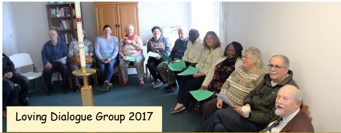
Loving Dialogue Group 2017