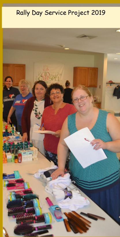
Rally Day Service Project 2019